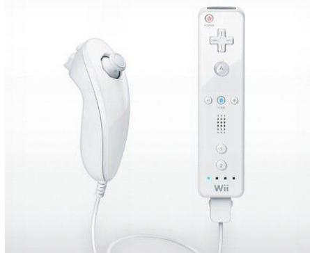
Figure 3. Nintendo Wii Nunchuk (left) and Wiimote (right).

The Wiimote and Wii nunchuk (Figure 3) are the control hub for all aspects of the piece and its performance, including the main mix, video processing, audio processing of the two inputs, as well as triggering various aural events and cues throughout the performance. The Wiimote should be strapped to performer's lower left arm using a masking tape or similar method and preferably hidden under a sleeve. Its role is primarily to relay data from the nunchuk and more importantly to provide tactile feedback in the form of vibrations that can be sensed due to its close contact to the arm. Namely, whenever a particular option is toggled on or triggered, the Wiimote will vibrate acknowledging the command. The nunchuk's cord should be hidden inside the sleeve and the controller held in the left hand as inconspicuously as possible.