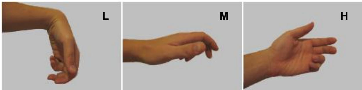
Figure 4. Planes of control (L = left, M = center, H = right).

Each plane of control offers 2 analog axes (designated as x and y relative to the arm and joystick plane) or 4 triggers (designated as left , up , right , and down relative to the arm and joystick plane) using the Nunchuk joystick. These behaviors can be modified using the two buttons in the front of the Nunchuk, using the index and middle fingers, as follows: